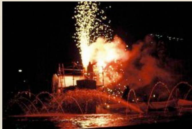
Figure 2 | Guardians of the Concourse , Canberra Theatre Centre forecourt, 1993.

This passage conveys what is important and unique about theatre compared to other artforms. The truths also have the potential to become the foundation of shared experiences of meaning . These are an extension into the audience of the truths, where the words and movements and feelings conveyed by a performer reach out and, together with the