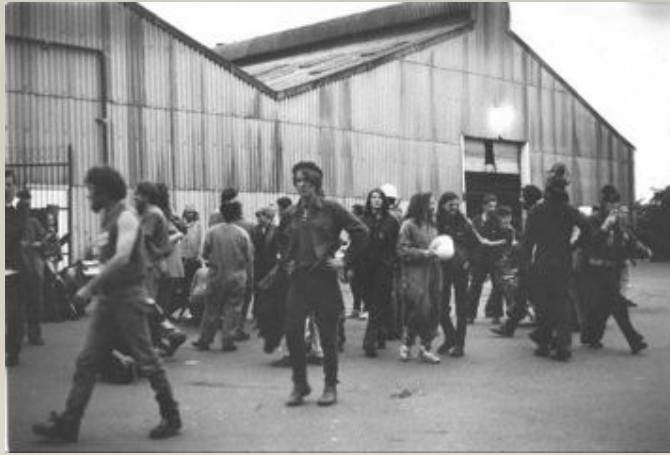
Figure 3 | Flowers of Gold , Old Kingston Bus Depot 1992.

What Splinters ultimately created was a community of shared meaning , a most powerful intangible cultural heritage. In thinking about how to capture and present this heritage, I have been especially drawn to the recent description by Rogiers and Truyen of a threefold framework for more meaningful and nuanced representation of complex historical subject matter through digital media: the traditional approach of