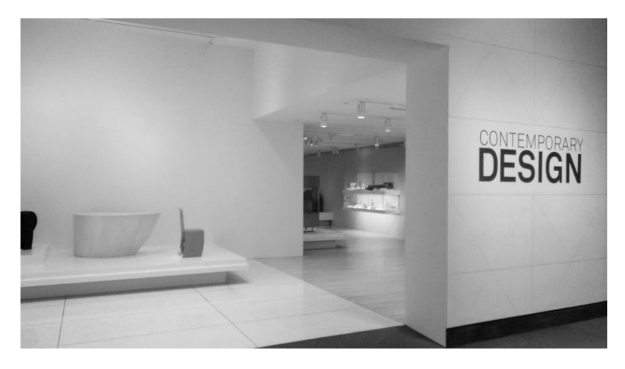
Figure 1. The entrance to the IMA Contemporary Design Galleries showing the variety of surface finishes and construction materials.

In March of 2011, the Indianapolis Museum of Art (IMA) opened a new scientific analysis facility for the study and protection of the museum's encyclopedic collection of artworks. Almost simultaneously, the IMA embarked on a number of new construction projects that included a redesign of the display space for its African collection and the creation of a new 11,000 ft2 gallery for contemporary design objects [Figure 1]. IMA scientists and conservators were called on to vet all of the construction, display, and storage materials for each of these major projects. As a result of the heavy workload needed to assess these samples, the process for materials suitability testing was significantly refined. This lecture will describe the analyses (Oddy tests and fading experiments) performed to assess the various materials used in these construction projects and will highlight the various successes and challenges experienced. The collections care staff had to balance comprehensive testing with tight construction costs. As is the case in any such large endeavor involving contributions from numerous institutional collaborators, many negotiations and compromises were part of the process of bringing these new gallery spaces into being.